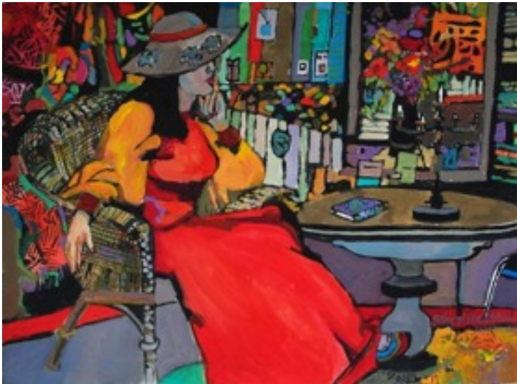
The Artist's Muse 2 by Betsy Dillard Stroud