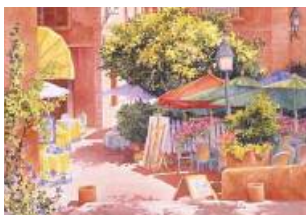
"Ready for the Lunch Crowd"

March 31-April 4, Scottsdale, Ariz. June 4-8, Virginia City, Nev. August 11-14, Janesville, Wis. September 10-19, Halsey, Neb. October 6-10, Kansas City, Mo. October 22-26, Calgary, Canada November 2-8, Myrtle Beach, S.C.