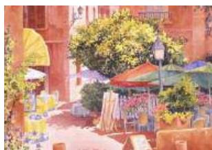
"Ready for the Lunch Crowd"

March 31 - April 4 - Scottsdale, Ariz. June 4 - 8 - Virginia City, Nev. August 11-14 - Janesville, Wis. September 10-19 - Halsey, Neb. October 6-10 - Kansas City, Mo. October 22 - 26 - Calgary, Canada November 2 - 8, Myrtle Beach, S.C.