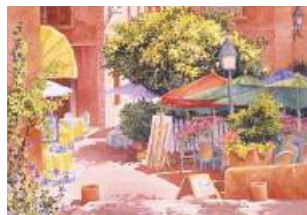
"Ready for the Lunch Crowd"

March 31-April 4, Scottsdale, Ariz. June 4-8, Virginia City, Nev. August 11-14, Janesville, Wis. September 10-19, Halsey, Neb. October 6-10, Kansas City, Mo. October 22-26, Calgary, Canada November 2-8, Myrtle Beach, S.C.