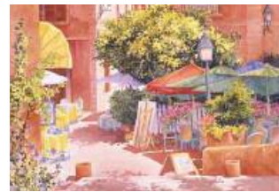
"Ready for the Lunch Crowd"

March 31-April 4, Scottsdale, Ariz. June 4-8, Virginia City, Nev. August 11-14, Janesville, Wis. September 10-19, Halsey, Neb. October 6-10, Kansas City, Mo. October 22-26, Calgary, Canada November 2-8, Myrtle Beach, S.C.